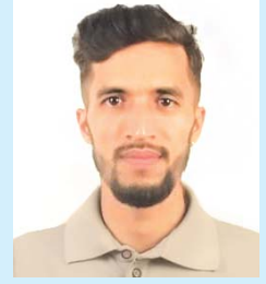
पोषण चन्द्र असिस्टेन्ट प्लान्ट अपरेटर